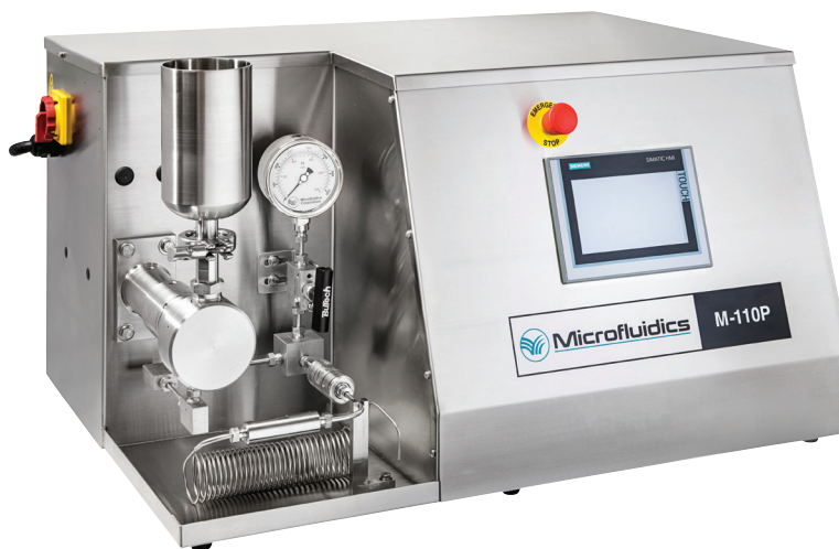
Model shown is subject to change depending on options selected.